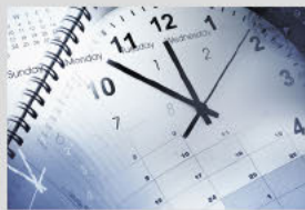
Time & Attendance