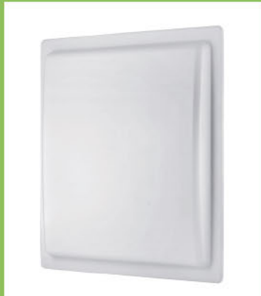
UHF 10 series