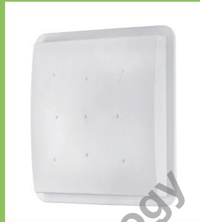
UHF 5 series