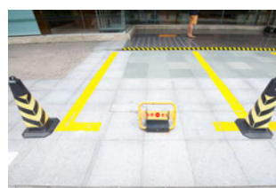
Private parking management