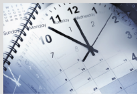
Time & Attendance