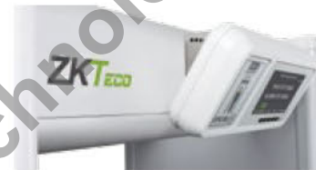
◀ Metal bracket