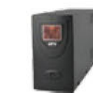
◀ Power supply and linkage interface