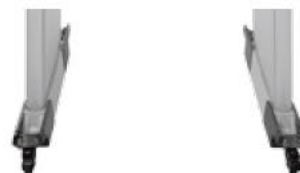
◀ Universal wheel